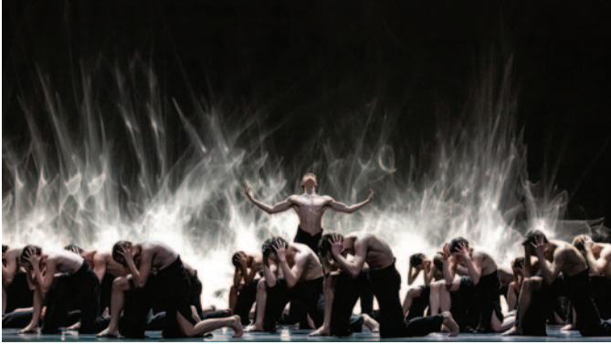
The National Ballet of Canada – Angels' Atlas by Crystal Pite