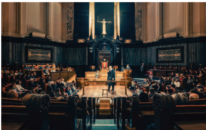
Witness for the Prosecution celebrates its 7th Birthday in October.