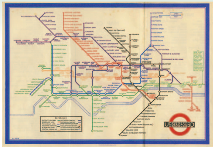
The first pocket edition of the Underground map by Harry Beck, January 1933 copyright TIL @ London Transport Museum.

Visitors will join The Natural Theatre Company as they take you on a whimsical whirlwind of fact through the worlds of design, transport, modern history, and an addiction to getting it right.