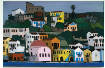
Islands by Norman Hyams.