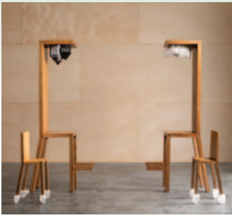
Chairs for Human Use with Chair for Spirit Use.