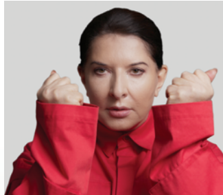
Marina Abramovic, Film still from Body of Truth © Indie Film, 2019.

More than an opening, the advent of Moco is an invitation to explore, engage, and encounter art in its exciting forms. For further information and tickets, visit www.mocomuseum.com